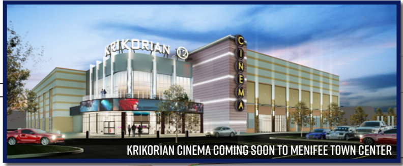
KRIKORIAN CINEMA COMING SOON TO MENIFEE TOWN CENTER